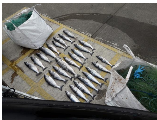
Figure 1: Two illegal fixed nets (over 600 m in length) and 28 salmon seized in June 2017

An extensive range and number of illegal items were seized during 2017 ranging from fishing rods, dinghies, spears, hand lines and nets. In total 651 illegal fishing items were seized which included 264 nets measuring 14,055 m.