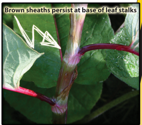
Brown sheaths persist at base of leaf stalks