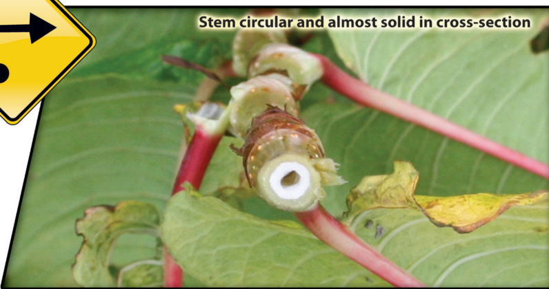
Stem circular and almost solid in cross-section