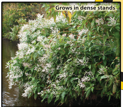
Grows in dense stands