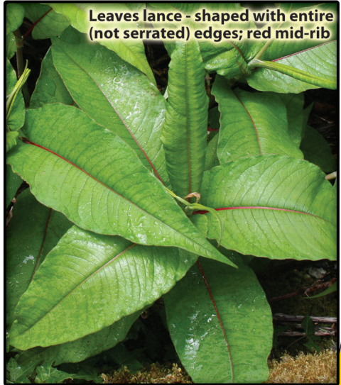
Leaves lance-shaped with entire (not serrated) edges; red mid-rib