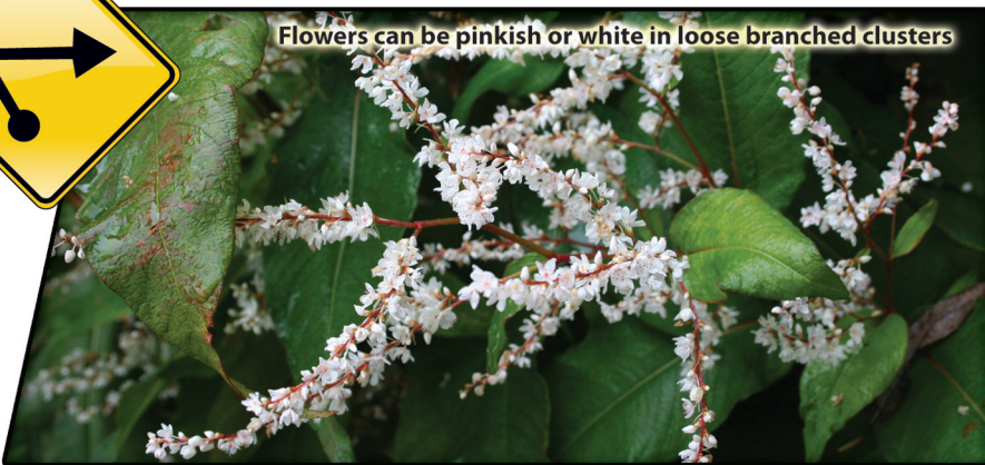
Flowers can be pinkish or white in loose branched clusters