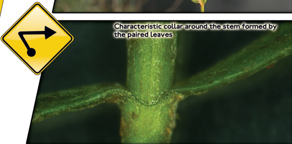
Characteristic collar around the stem formed by the paired leaves