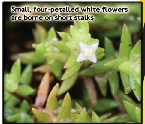
Small, four-petalled white flowers are borne on short stalks