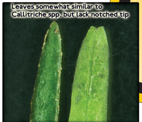
Leaves somewhat similar to Callitriche spp. but lack notched tip