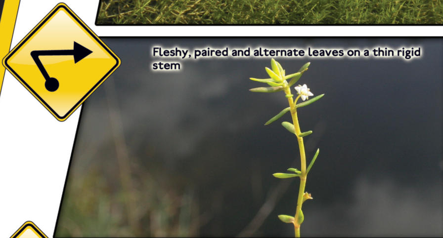
Fleshy, paired and alternate leaves on a thin rigid stem