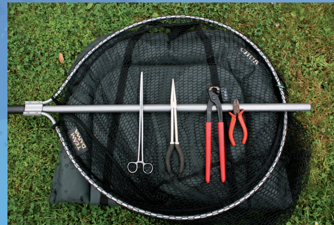
Large net, unhooking mat, forceps, pliers and wire cutters are all essential tools for handling/release of pike.