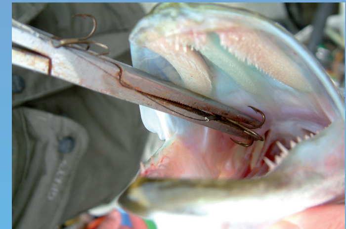
With deeply hooked pike, an artery forceps should be used.

Pike are built for short sharp bursts of energy and so from the moment they are hooked they expend their energy quite rapidly. As pike are not used to prolonged periods of exertion, playing puts them through great strain and so every effort should be made to land the fish quickly. This is particularly relevant during the summer months when oxygen levels in the water are low. One exception is when a pike is hooked from a deep lie (25ft/7.5m). In this case the fish should be brought slowly up to the surface to allow it to adjust to the change in water pressure and thus avoid gassing. A strong rod coupled with strong line will help to bring the fish in quickly. A longer rod will give better control when seeking to avoid snags such as weed. Once tired, the pike may be unhooked in the water (lure or fly fishing), or else it should be drawn in over a large landing net. Choose a knotless mesh landing net that is resistant to tangling with treble hooks.