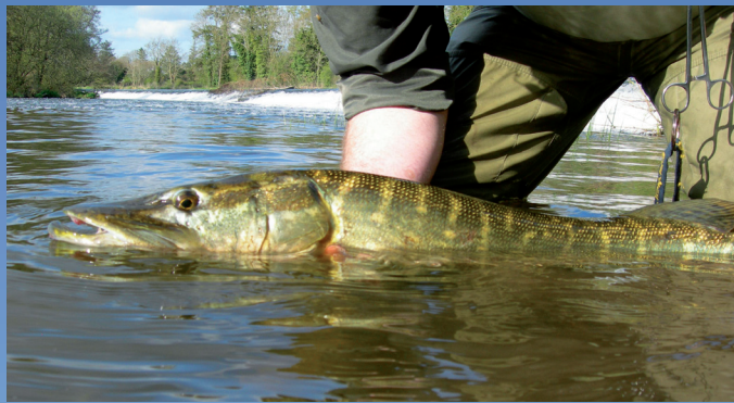
Pike should always be carefully returned to the water.

gill covers. For stubborn hooks, wire cutters should be used to snip the barbs off to allow for easier extraction. Remember, hooks can easily be replaced but pike cannot.