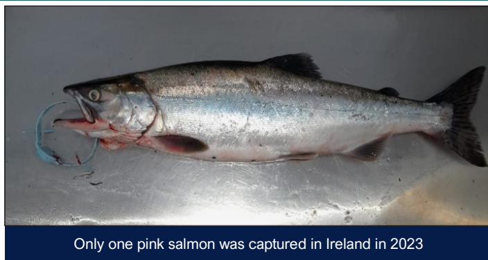
Only one pink salmon was captured in Ireland in 2023

detect whether pink salmon entered these river systems over this period. The project was funded by the Salmon and Sea Trout Rehabilitation, Conservation and Protection Fund and is intended as a precursor to IFI's involvement in PINKTrack, an EU-wide project supported by the North Atlantic Salmon Conservation Organisation (NASCO). It is envisaged that the eDNA samples will be analysed as part of PINKTrack.