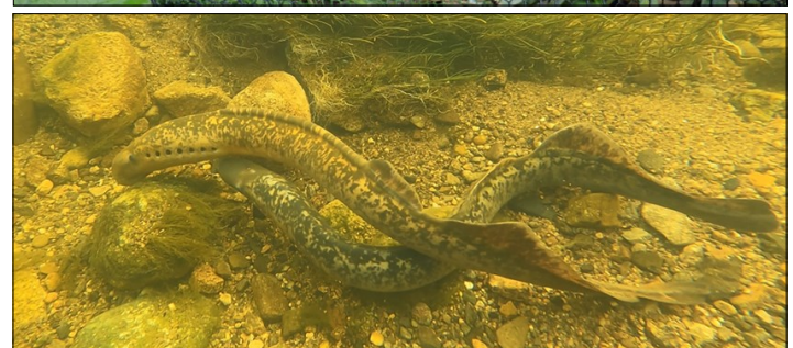
Top: twaite shad. Bottom: sea lamprey spawning.