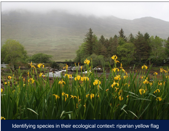
Identifying species in their ecological context: riparian yellow flag

“Aquatic Plants in Ireland – A Photographic Guide” is available in a €40 softback edition and a €70 hardback edition, excluding postage. For purchase enquiries, please contact Ronan Matson at ronan.matson@fisheriesireland.ie .