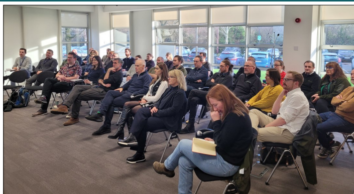
IFI research staff attending the seminar at Citywest HQ

On December 12th, IFI Research & Development held a seminar in which research staff gathered to give brief talks on their highlights from their work during the year. This Christmastime event gives IFI staff an opportunity to show the breadth of their work throughout the year and share some of their exciting and interesting results with their colleagues.