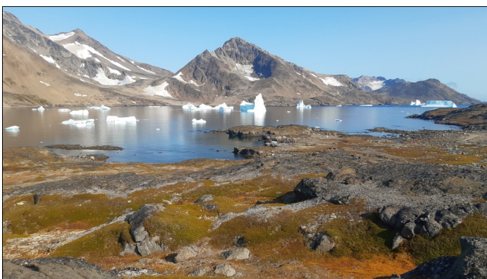
Icebergs: a hazard to fieldwork in Greenland's coastal waters

Atlantic salmon are famed for their epic migration from rivers around Europe northwards to where the cold waters of the Arctic Ocean meet the North Atlantic Ocean, where they range over a vast area of ocean foraging for prey before returning to their natal rivers to spawn. The survival of salmon as they mature into adulthood and migrate through these remote waters is a key question in salmon conservation. Marine mortality is thought to be a significant factor in the decline of salmon numbers returning to rivers over recent decades, but detailed information on the life of salmon at sea is scarce.