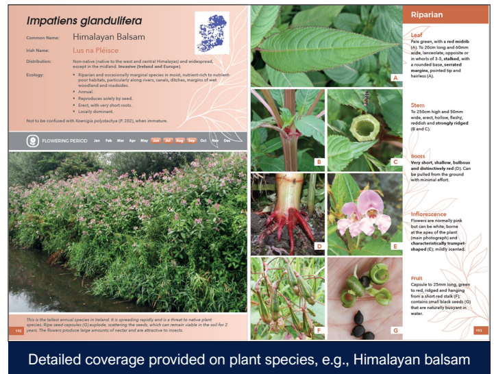
Detailed coverage provided on plant species, e.g., Himalayan balsam