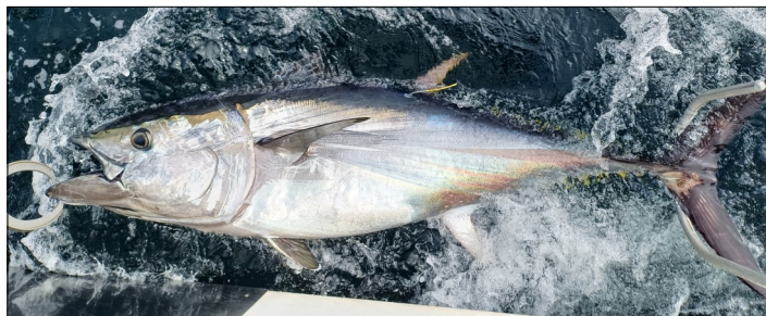
Map: Tuna CHART recaptures. Image: Floy-tagged bluefin