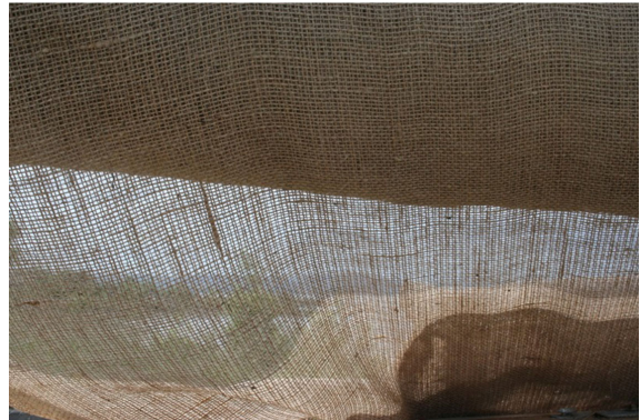
Figure 3. A view through the open-weave jute matting used to kill Lagarosiphon major in Lough Corrib.