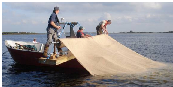
Figure 4. Jute matting application using a purpose modified boat (photograph by Joe Caffrey).