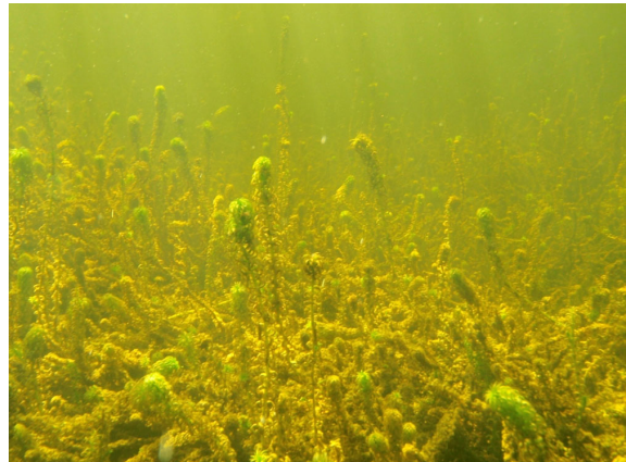
Figure 2. Typical Lagarosiphon major -dominated habitat prior to jute application.