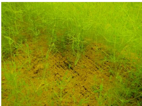
Figure 6. Nitella flexilis growth on the jute matting 8 months after application at site Ard Point.

prepared onshore. The jute is commonly laid in 100 m-long strips. Divers are present in the water to oversee the accurate placement of the material and to ensure that strips overlap properly, where this is required. Small weights are attached along each side of the matting, at roughly 5 m intervals, as the material is being laid on the water. This aids in its proper placement on the target weed bed. The matting is secured on the lake bed by the divers using additional weights or pins (Figure 5). Alternatively, where smaller beds of L. major (< 200 m 2 ) are the primary target, pre-cut sheets of the jute (each ≤ 5 m × 15 m) are manually laid over the target weed bed from a boat or are brought into position by divers from the shore. As before, the material is secured in place by divers.